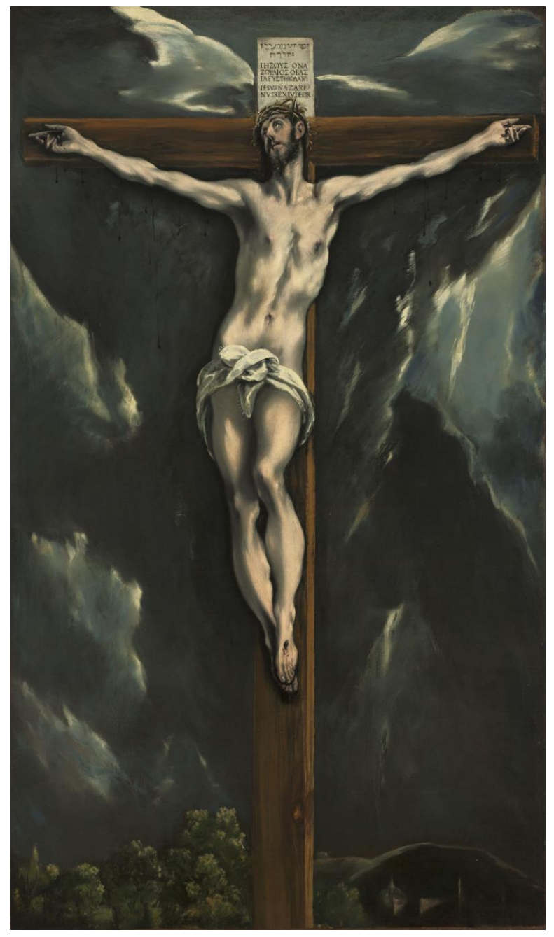
The Cleveland Museum of Art's early 17th-century painting of "Christ on the Cross" by El Greco is part of a multidisciplinary study of how artificial intelligence can be used to attribute authorship of artworks by measuring and comparing tiny details of individual brushstrokes that can't be controlled by the artist or seen by the naked eye.

To meet the high demand for their paintings, artists such as El Greco, Peter Paul Rubens, and Rembrandt employed large workshops, at times making multiple versions of the same image. Scholars have been embroiled for decades in extended debates over how to attribute such works,