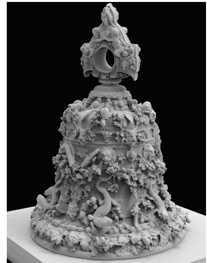
3-D rendering of the Cellini Bell

Washington, D.C., is a ring of ten pealing bells, used for change ringing, called “The Bells of Congress.” Cast by Whitechapel in 1976, the bells range in weight from 581 to 2,953 pounds. Another Whitechapel ring of ten bells hangs in the tower of the Washington National Cathedral. Cast by Mears & Stainbank in 1962, the bells range from 608 to 3,588 pounds.