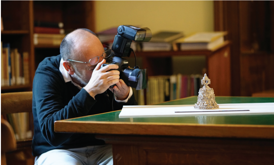
The Cellini Bell was recorded by Factum Foundation's expert, using close-range photogrammetry, at the British Museum in 2018