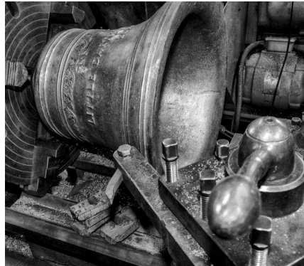
Bell at the Whitechapel Bell Foundry in 2016

Following the 3-D recording of the bell, a research project is now underway to carry out data processing using MagmaSoft, an advanced software that can predict flow and shrinkage. Once the analysis has been carried out, the data will be distorted.