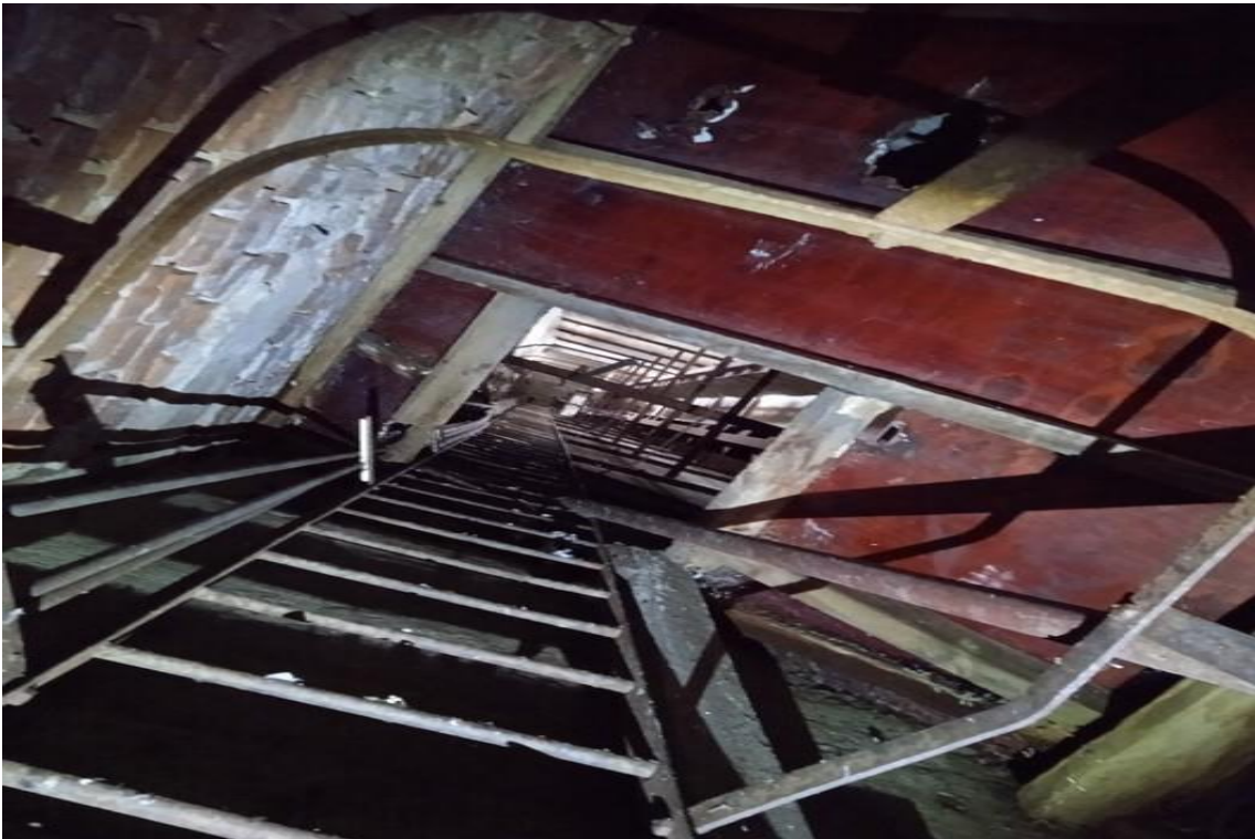
Looking up the 28m high conveyor shaft of the AaltoSiilo, the new route for visitors to the building.

The restoration of AaltoSiilo develops a language that showcases the building's stages, from conception to deterioration, to its repair process. Furthermore, renovating the Silo interior involves repurposing all timber platforms and structures and the original doors and windows.