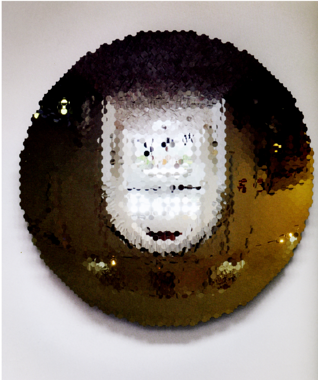
opposite Islamic mirror, 2008 Stainless steel, 249.6 cm diameter Installation view, Sala Sharq al-Andalus of the Monastery of Santa Clara, Murcia, 2008 Courtesy the artist Photograph José Luis Montero