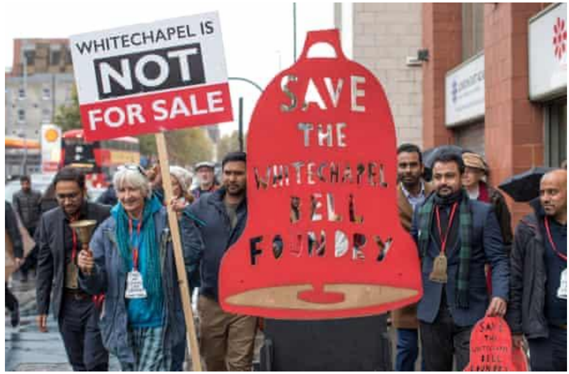
Campaigners marching to save the Whitechapel Bell Foundry in 2019.

Over the years, the fate of the foundry had become more than just a local story. The clash between the bells and the boutique hotel seemed to encapsulate decades of upheaval and anxiety, as global finance has reshaped London into a place where returns on investment often trump the interests of the people who live there. The redevelopment of England's oldest factory by an American private equity firm; a manufacturing business gutted of its machinery and transformed into a manicured lifestyle destination. If the story had been fiction, a reader might have felt the symbolism could be toned down a bit.