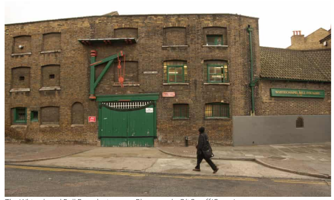
The Whitechapel Bell Foundry in 2009.