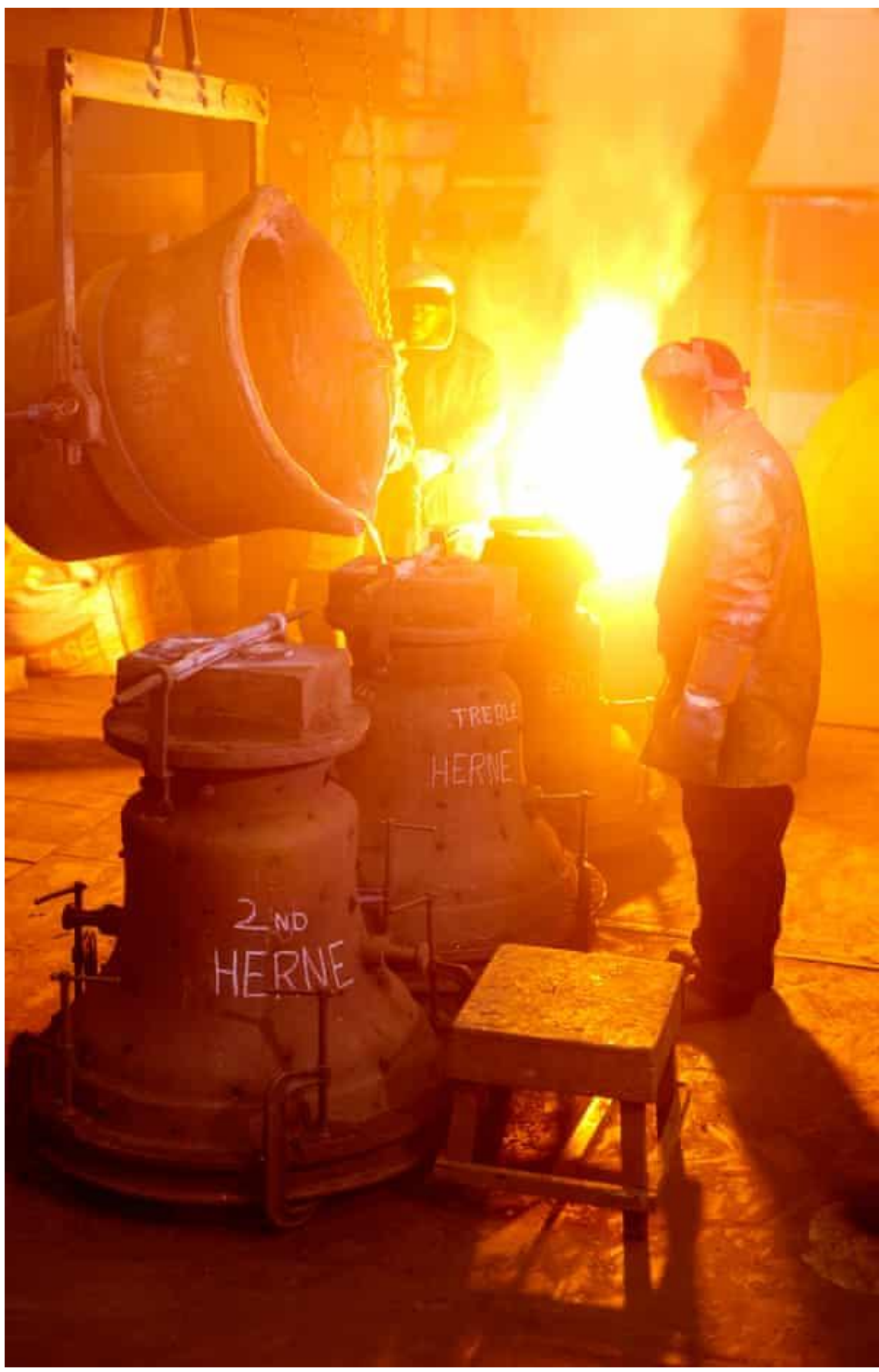
A worker at The Whitechapel Bell Foundry casting bells for the parish of Herne in Kent in 2011.