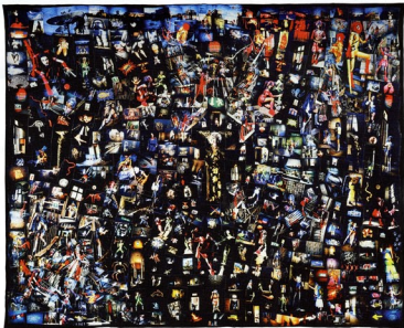
View at the exhibition "Penelope's Labour" of 2011 at the Cini Foundation in Venice with wallhangings by Craigie Horsfield and Grayson Perry