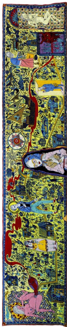
The Walthamstow "Tapestry", 2009; 15 x 2.90 m; edition 3 pieces and 12 pieces in a smaller format; managed by Factum Arte, produced by Flanders Tapestries and edited by Paragon Press in London

Perry shows little interest in, or awareness of, the contemporary development of woven tapestry as an art form. His approach looks back to the historic European tradition of woven tapestries, which were essentially large-scale, flexible paintings, produced at enormous expense for kings and princes. The emphasis was on the drawing, imagery and content, the message being conveyed. As a hand-maker, he will be aware of the intertwining of time and skill required in the production of any crafted artefact. In his Jacquard works he explores the possibilities of producing large-scale tapestries, redolent of castles and great, crumbling aristocratic traditions, with an industrial process, and modern, computer-assisted technology. I believe this juxtaposition of object and mode of production is absolutely deliberate, and reflects his skill and subtlety as an artist.