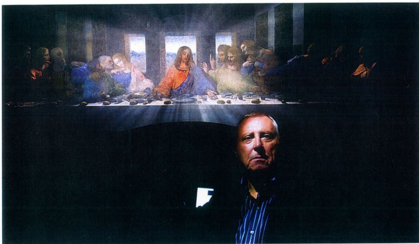
Peter Greenaway with his Leonardo's Last Supper during one-night light performance on June 30, 2008, at the refectory of Santa Maria delle Grazie, Milan.

THE FILMMAKER PETER GREENAWAY likes to ruffle feathers—if not, indeed, to pluck the whole bird naked. He had ample opportunity to do both in the run-up to his “dialogue” with Leonardo da Vinci’s Last Supper in Milan last year. Leonardo’s Last Supper (2008) is the second work (after Nightwatching , 2007, based on Rembrandt’s Night Watch ) in a Greenaway series aimed at revitalizing great paintings that have become so broadly familiar we have lost the knack of really seeing them. He describes his primary concern as “visual literacy”; his intention for Leonardo’s painting was to reveal its Christian saga of betrayal and redemption, along with its innate cinematographic character, using light, sound and text. “We’re out