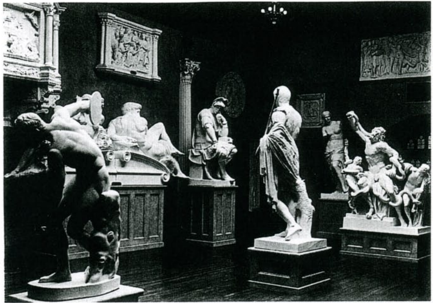
Hall of Casts at Vassar College, Poughkeepsie, N.Y., early 1900s.

By the new millennium, both the original Veronese and the buildings on the island of San Giorgio Maggiore in Venice had been restored, and the Fondazione Giorgio Cini, which now owns the island and occupies the ex-monastery, wished to cap off its refurbishing of Palladio's refectory with a re-installation of the Veronese. In 2006 they turned to Factum Arte. Viewers today have a choice: they can go to the Louvre to see what are substantially, if not entirely, the canvas and pigments with which Veronese