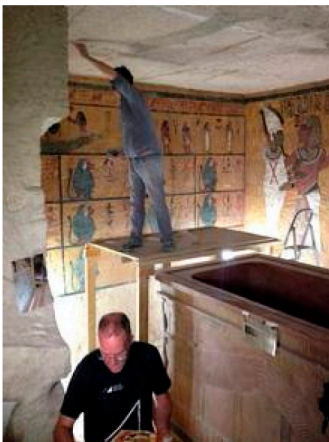
The replica tomb was created off site, with every little detail matched to the original

The remarkable five-year project has been filmed for a special documentary for a BBC Travel Show called A New Tomb for Tutankhamun .