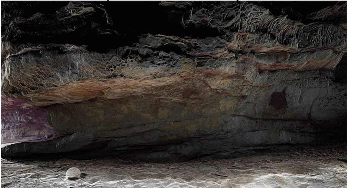
LiDAR laser-scan data of the vandalised cave

The mapping of the vandalised areas of the cave from the LiDAR and photogrammetry data will be used in combination with photographic documentation dating from before the attack to produce an accurate 3D restoration. This will lead to the creation of an exact physical facsimile of the cave, at a scale of 1:1, to be displayed at the first 'Pavilion of Indigenous People', at the garden of the Knights of Malta, during the 2019 Venice Biennale of Art. It is hoped that this forensically accurate technological statement will have a real-world impact, helping the Wauja with what they believe to be the only way to safeguard the knowledge incised into the sacred cave of Kamukuwaká. The long-term aim is to reclaim the sacred cave and its surroundings as indigenous lands and reinstate a village nearby. After the exhibition in Venice, the facsimile of the restored cave will be sent to the Wauja community. It will be able to continue its work of transmitting a sense of place and history from one generation to the next.