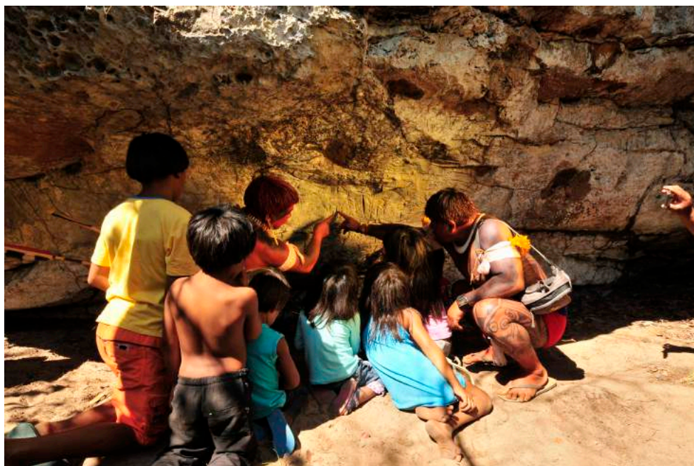
The engravings at Kamukuwaká serve a pedagogical function of transmitting the mythological narratives of the Wauja people

In January 2018, during a visit to the area, the walls of the cave were untouched. In September 2018, an expedition to Kamukuwaká was organised as one of the first steps in a project to ensure the preservation of the listed cave. Collaborating with an independent team of Brazilian anthropologists, it aimed to document the site using high-resolution 3D-imaging technologies, including laser-scanning and photogrammetry: precautionary measures intended to safeguard against precisely such a disastrous event. Upon arrival at the site, it was revealed to have been devastated with the most important petroglyphs hacked away. Factum Foundation's team recorded the site in its vandalised state.