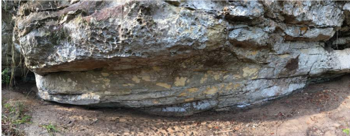
Kamukuaká: damage to the rock art panel in September 2018

The exclusion of this important element of indigenous, national, and world heritage from the Xingu people's demarcated territory contributed to the tragedy that befell the site in 2018, when the engravings were systematically destroyed. Although the exact identity of the assailant is unknown, the destruction is representative of the tensions felt between indigenous and farming communities in Mato Grosso. In addition, deforestation at the headwaters upstream has resulted in increased sedimentation of the river and the rise of the water levels, aggravating the factors of erosion to which the rock art panels in the cave are directly exposed. Kamukuaká is a site that deeply resonates with the traditions of the inhabitants of Xingu, as well demonstrates the grave contemporary threats to their way of life.