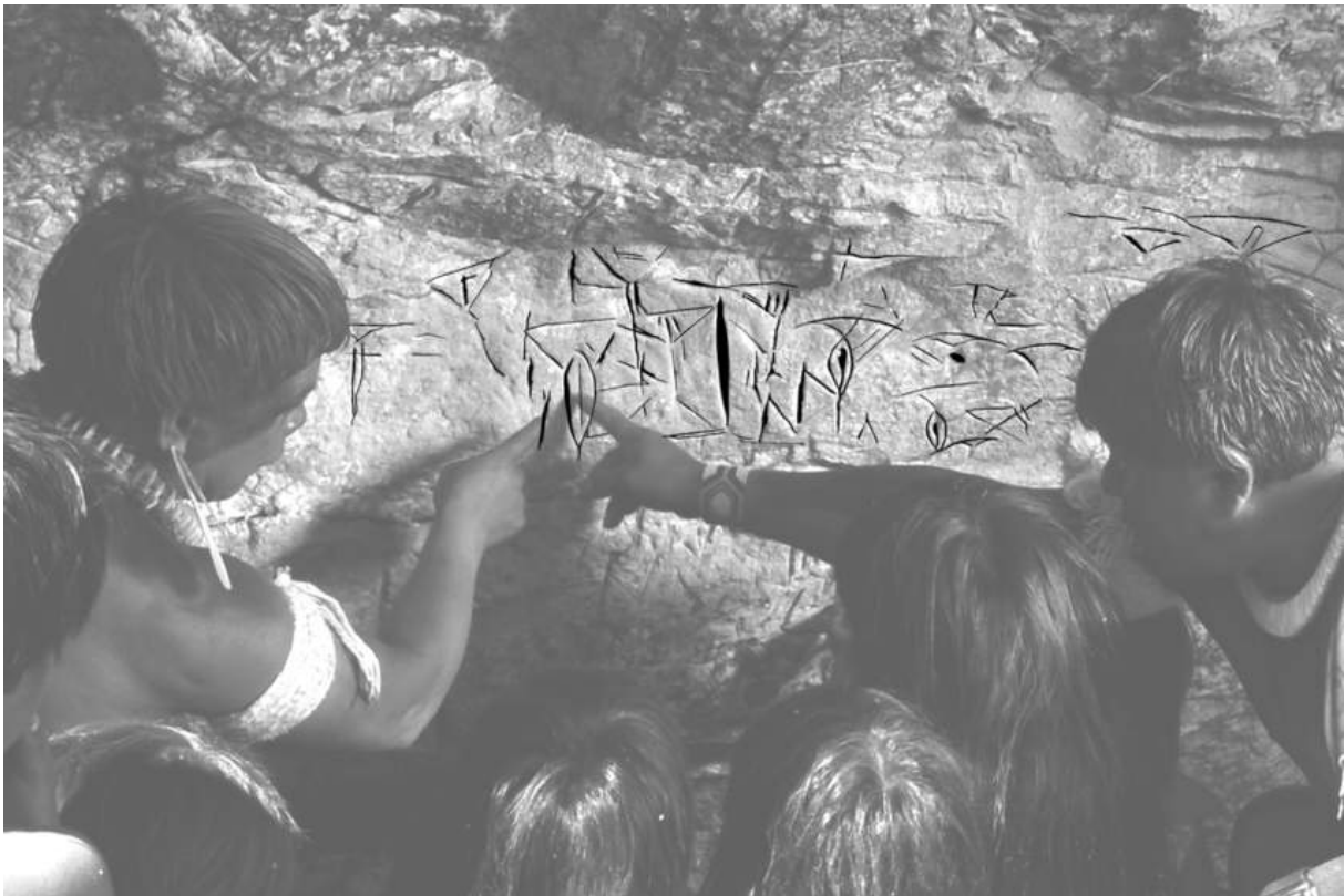
Preparing the creation of a new geometry of the vandalised areas by projecting 2D information into a new 3D mesh

The engravings, restored through 3D-modelling from the historical photographs, will reinstate sections that have been removed by the iconoclasts. This is painstaking scientific work on local knowledge and documentary photographs. But this digital reconstruction can preserve the memories and creation myths of the Wauja people. In an unstable political situation, there are more and more examples of orchestrated destruction or mindless vandalism. It is increasingly urgent to demonstrate that technology can be used to help to face fundamentalist or commercially motivated destruction of cultural heritage. Preventative and post-damage digitisation, as well as 3D reconstruction, will never replace the value of at-risk or vandalised testimonies from the past. It is nonetheless becoming more and more urgent to demonstrate that there are ways to face those threats.