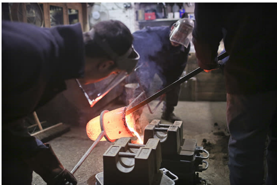
Pouring molten metal at the bell foundry

Against this is ranged the red-blooded foundry scheme conceived by Factum Arte, a leading producer of sculptures and a pioneer in the use of digital scanning and 3D-printing techniques to create art as well as copy ancient treasures to a hitherto unimaginable degree of faithfulness. Its best-known project was a facsimile of the burial chamber of the boy-pharaoh Tutankhamun, designed to protect the original from further deterioration and now installed at the Valley of the Kings.