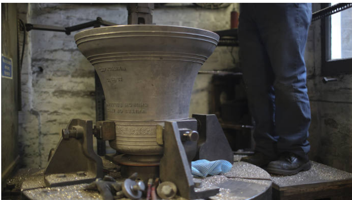
A bell at the Whitechapel Bell Foundry, London

Plans are afoot to turn the historic foundry into a hotel — but a group of cultural figures has another idea.