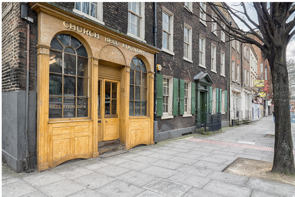
The entrance to the foundry on Whitechapel High Street

The Whitechapel Bell Foundry had been in business in the borough since about 1570. Its bells included some of the best-known in the world, from the Liberty Bell in Philadelphia, bells in Westminster Abbey and Big Ben (which cracked not long after being hung in 1859, producing the sound we hear today). One of the firm's oldest surviving bells, which still hangs and is rung in the tower of St Clement Danes in the Strand, was cast in 1588, when William Shakespeare walked London's streets.