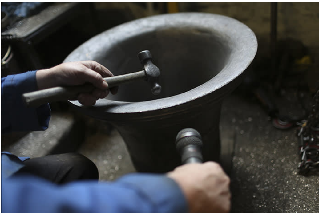
Bells being made at the foundry