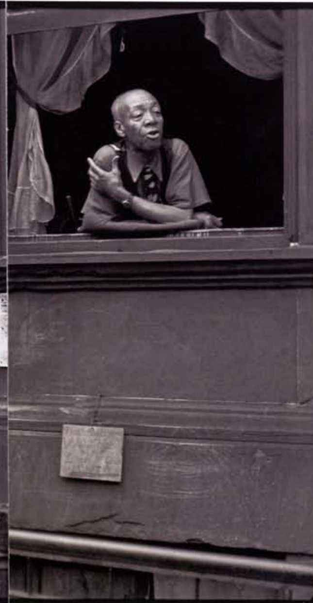
2 Brooklyn, NY, 1947