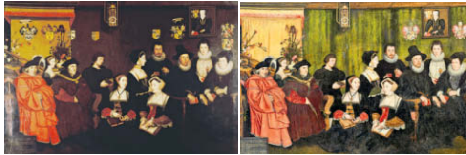
The 1593 Lockey painting alongside the restored version. Changes were ordered by Roy Strong, top

and wiped them off". He said he had kept two coats of arms but had the others removed because they were not painted "to the same quality".